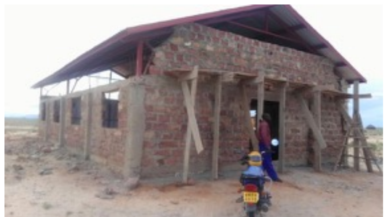
The Lodwar church has been repaired but still has some work that needs to be done for completion.

The church in Lodwar after the huge wind storm tore the roof off and knocked down the partially built walls.