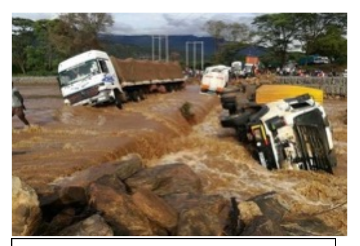
Even the biggest trucks with the heaviest loads are no match for the power of the raging waters

People think they are invincible, this is a common site when the rains come